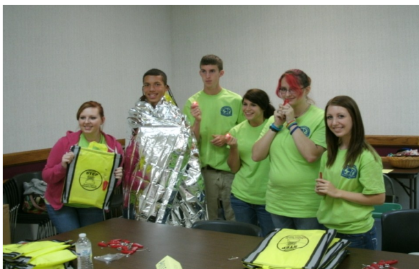
Students from Batavia High School joined us on Make a Difference Day to assemble emergency backpacks that will be given to elementary students as part of the STEP program. STEP is being funded through our Citizen Corps Council Grant.

The presentations were well received by the students and teachers. Since the program started, a total of 389 students and 16 teachers have been trained. Additional sessions will be held prior to the end of the grant period, which is July 31, 2013.