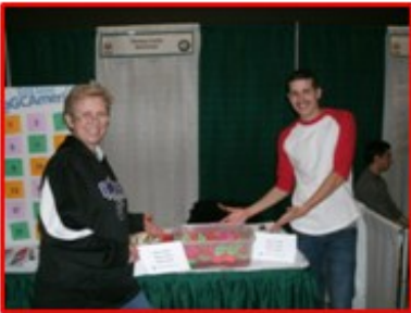
Left: Our display at the AmeriCorps Kick Off

4-H Camp Bristol Hills Gillam Grant Community Center Batavia Players Girl Scouts of Genesee Valley Batavia Youth Bureau GLOW YMCA Byron Bergen Central School GO Art Byron Bergen Public Library LeRoy Christian Community Project Camp Wyomoco Literacy Genesee Corfu Free Library Livingston County Historical Society Crossroads House Olean Theatre Workshop Genesee County Highway Olean City School District Genesee County History Orleans Community Action Genesee County OFA Orleans Co Adult Learning Services Genesee County Parks Orleans County Cooperative Ext Genesee County Sheriff's Office Richmond Memorial Library Genesee County Youth Bureau St. Mark's Episcopal Church Genesee Justice WNY Rural Area Health Education Center