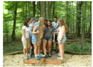
Right: AmeriCorps Team Building at Camp Wyomoco