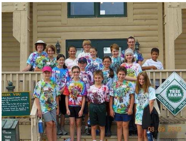
EnviroChamps camp participants at the Genesee County Interpretive Center

Envirochamps was very well-received. Several of the participants asked if the camp would be offered again, and many other community members who could not participate are eagerly awaiting information about an upcoming program.