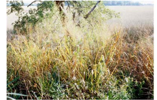
Panicum virgatum L. Switchgrass Symbol: PAV12 Group: Monocot Family: Poaceae Growth Habit: Graminoid Duration: Perennial U.S. Nativity: Native