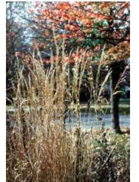
Sorghastrum nutans (L.) Nash. Indiangrass Symbol: SONU2 Group: Poaceae Family: Graminoid Growth Habit: Perennial U.S. Nativity: Native